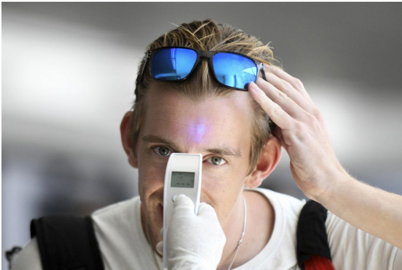
An arriving passenger's temperature is checked at Aurora International Airport in Guatemala City.

By Molly O'Toole , Cindy Carcamo March 17, 2020 10:47 AM